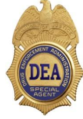
Drug Enforcement Agency