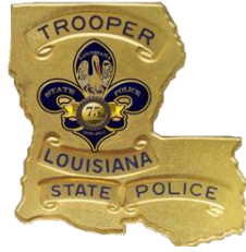
Louisiana State Police