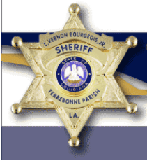
Terrebonne Parish Sheriff's Office